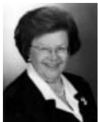
Senator Barbara Mikulski

I know who you are – whether you worked at Social Security getting Seniors their checks every month, at the IRS tracking down tax cheats, or as a customs agent securing our borders – you worked hard to make a difference in people’s lives. I believe in your work and I’m proud of all you’ve accomplished. So, when I heard about your concerns with the Federal Employee Retirement Information System, I wanted to do something about it.