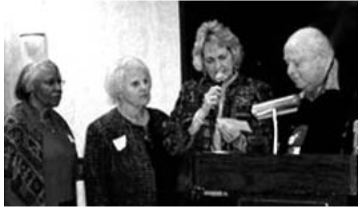
Presentation by St. Mary's County Chapter 969