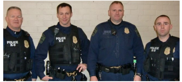
Greenbelt K-9 Unit Officers

Are you creative? Interested in learning and using web skills? The NARFE MD Federation is seeking a volunteer webmaster to optimize and maintain the new MD Federation WordPress website. This individual should demonstrate an ability to develop and maintain a website; have knowledge of or interest in learning WordPress; and be willing to perform overall general webmaster duties including additions, changes and/or updates to the website. Time involved: several hours a week to begin with but will gradually taper to a few hours a month. If interested or know someone who might be, please contact Linda Adams at: narfe409@hotmail.com .