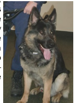
K-9 Unit's Dago sits by his handler