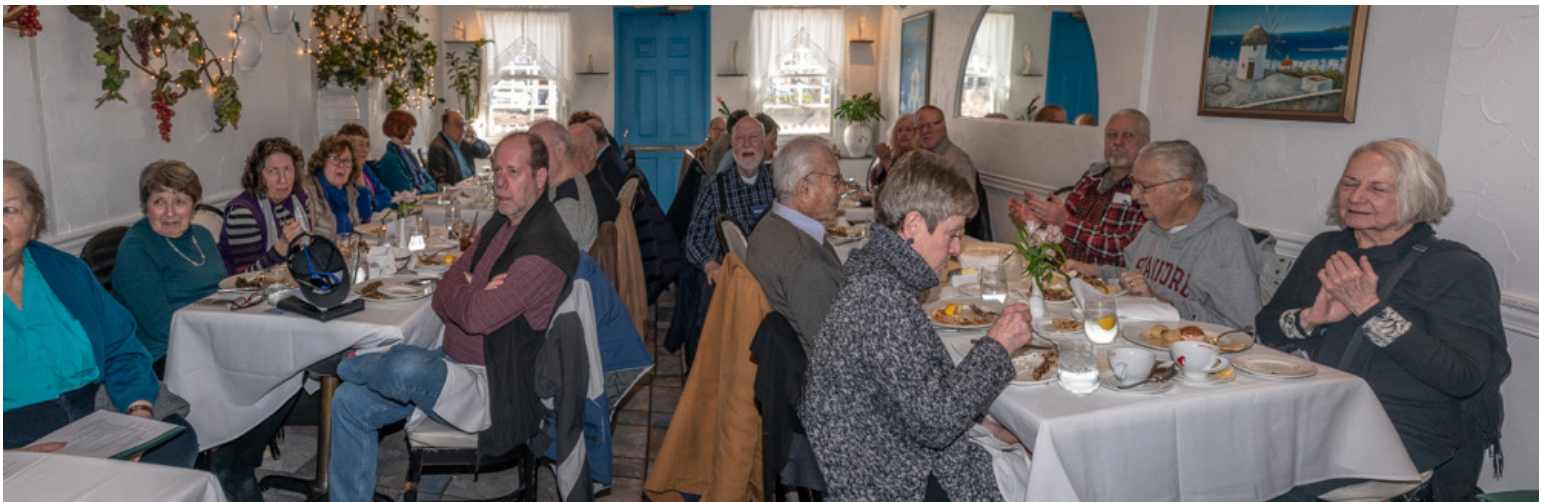
There was an excellent attendance at our January 11th Chapter membership meeting