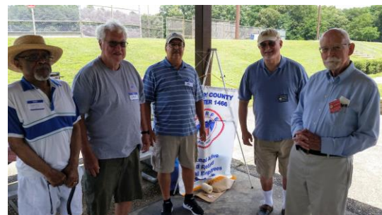
2020 Officers Swearing In at picnic