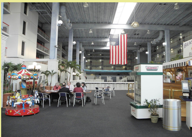
Convention committee sitting in atrium at the Carousel Hotel.