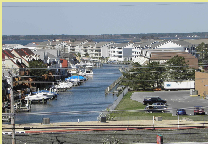
View from Carousel Hotel in Ocean City