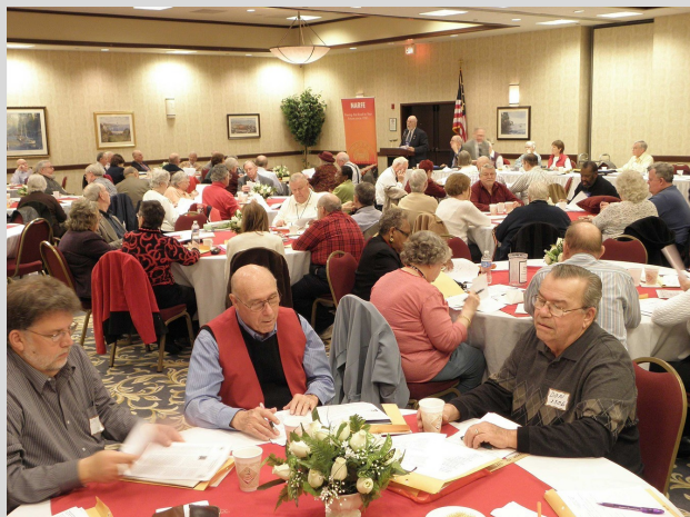
General view of the Board Meeting.