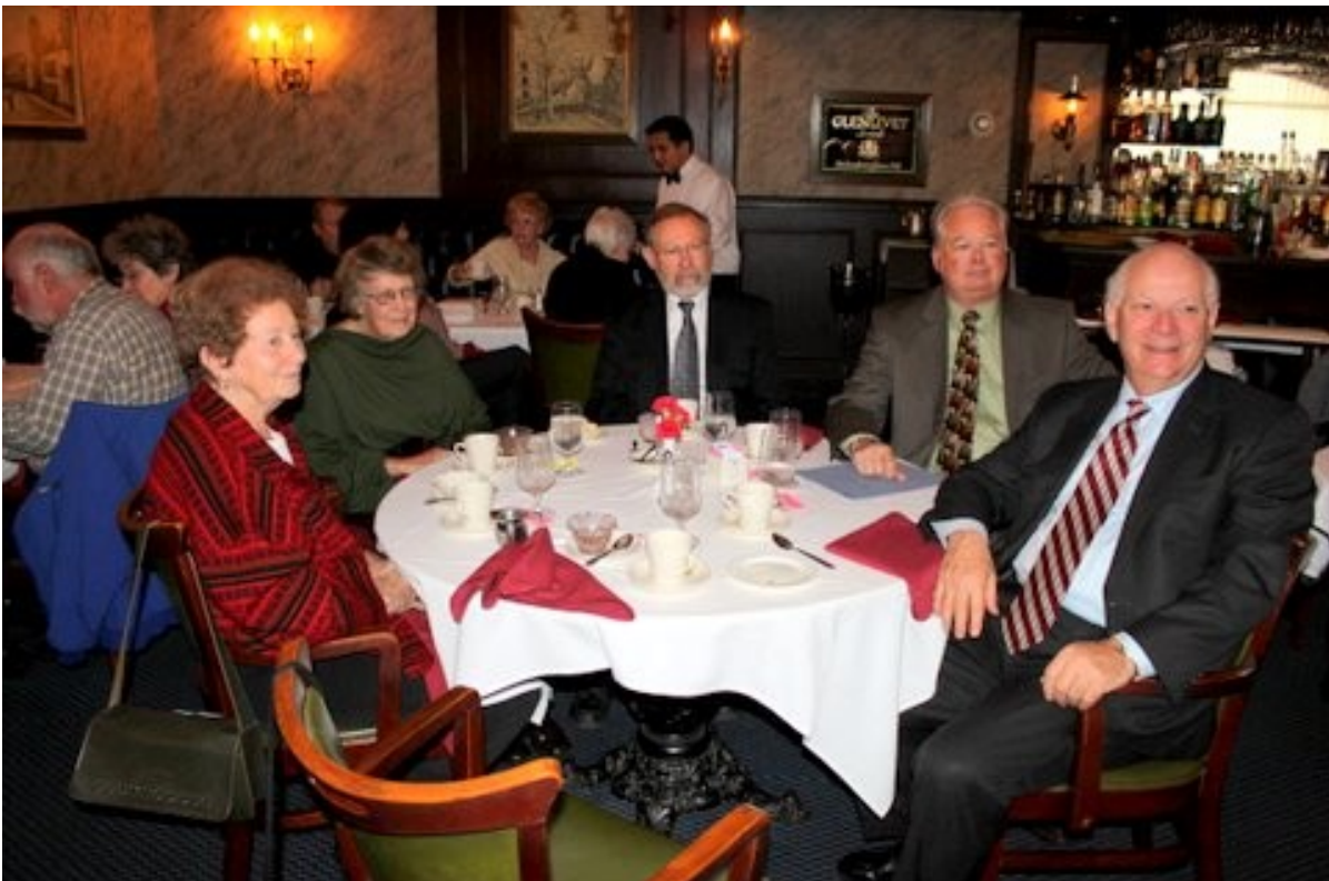
U. S. Senator Cardin (sitting on right) at the Chapter 1887 Luncheon