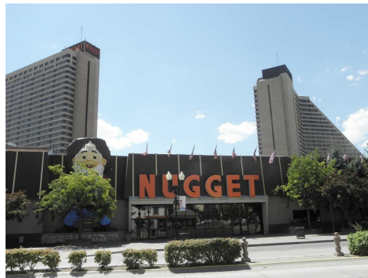
Nugget Hotel, site of the National Convention