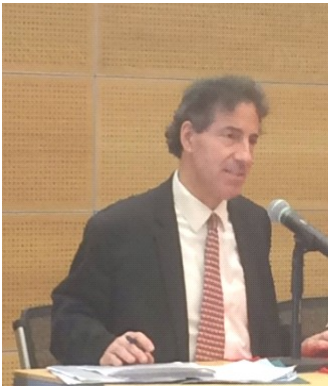
District 8 Congressman-elect Jamie Raskin