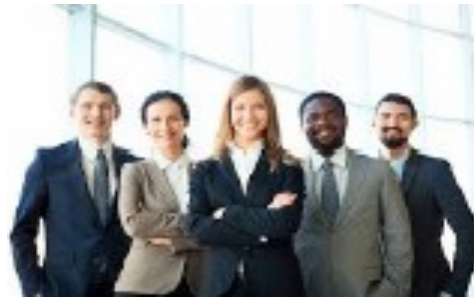
Recruit Prospective Members!