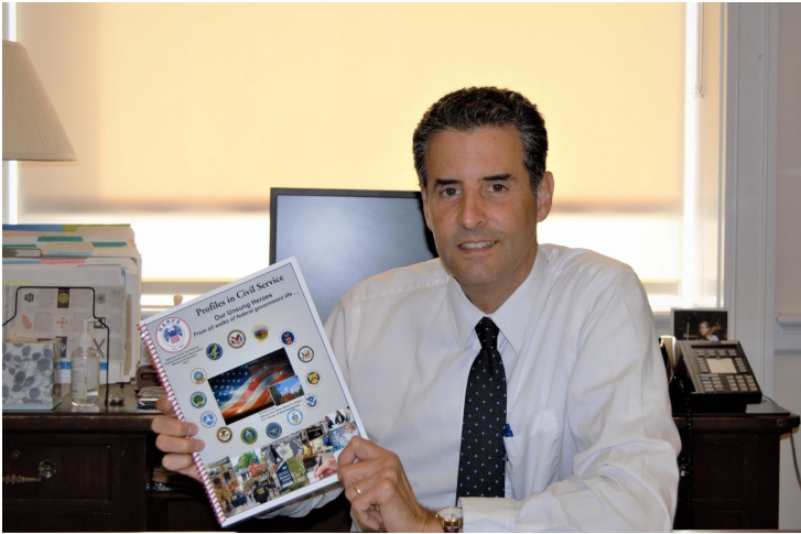
Congressman John Sarbanes, D-MD 3 rd District