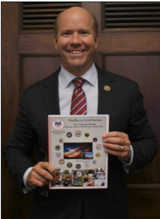
Congressman John Delaney, D-MD 6 th District