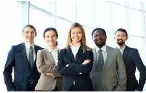
Recruit Prospective Members!