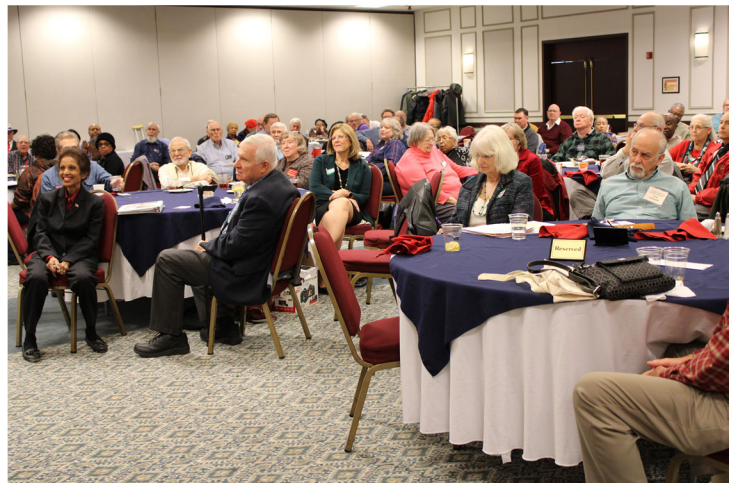
View of the attendees at the Feb. 7 Board meeting.