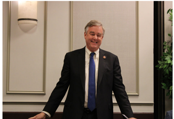
Feb. 7 luncheon speaker Congressman David Trone, (MD-06)