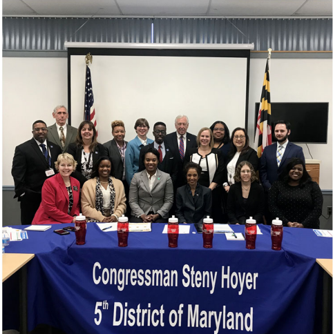
Majority Leader Congressman Steny Hoyer convened Tri County (Calvert, Charles and St. Mary's counties) Census 2020 Leaders to develop strategy to motivate undercounted and hard to reach population to respond timely.