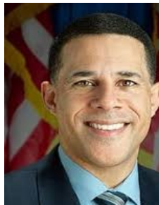
Congressman Anthony Brown (D-MD 4 th District)

“COVID-19 Resources and the 2020 November Election”