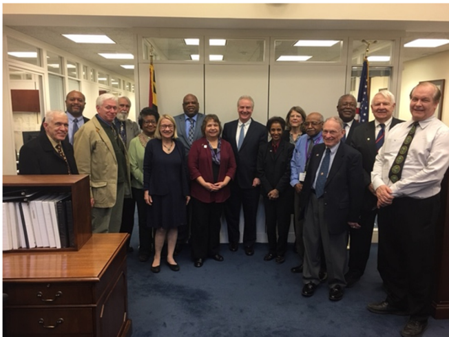
NARFE/MD Officers, Senate Leaders, Congressional District Leaders and Members with U.S. Senator Chris Van Hollen, of Maryland (center)