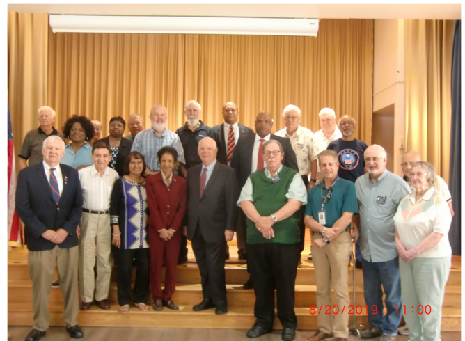
NARFE/MD Officers, Senate Leaders, Congressional District Leaders and Members with U.S. Senator Ben Cardin, of Maryland (center)