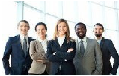
Recruit Prospective Members!