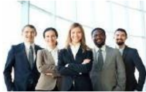
Recruit Prospective Members!