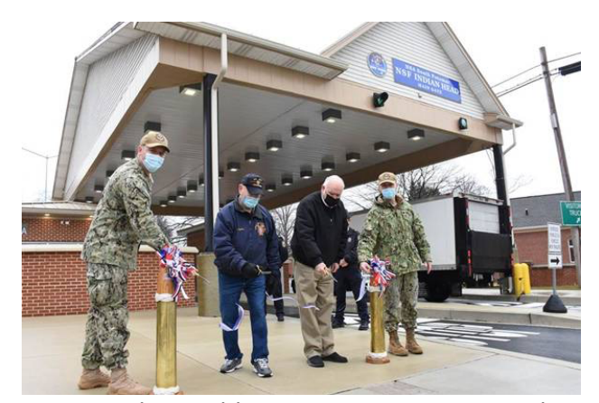
Chapter 1972, Waldorf-LaPlata, was invited to a ribbon cutting ceremony at the Naval Support Facility Indian Head, also known as the Naval Support Warfare Center, in Charles County, on Jan. 26, 2021.