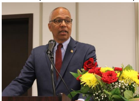
Guest Speaker Lt. Governor Boyd Rutherford