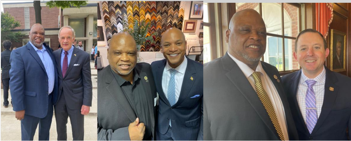
US Senator Tom Carper, Delaware MD Governor Wes Moore MD Senate President Bill Ferguson