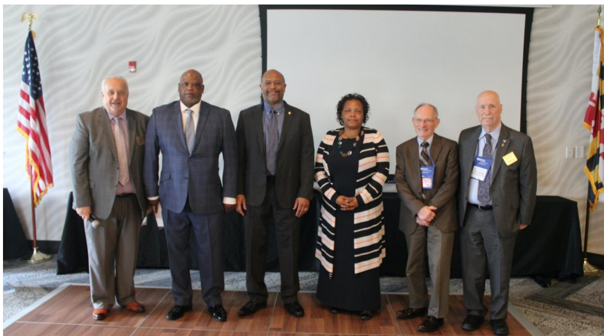
Installation of 2023-2025 NARFE/MD Officers