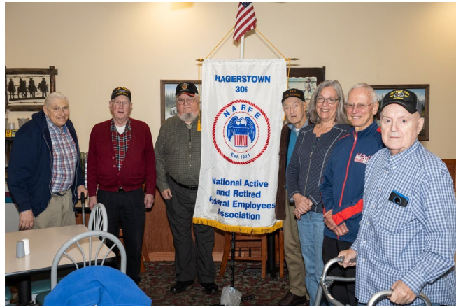
CHAPTER 306 Hagerstown