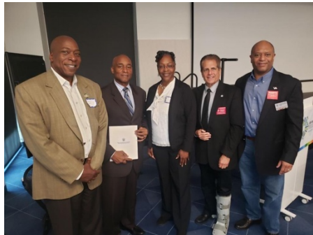
Photos from October 5, 2023, Maryland Military Coalition Listening Session