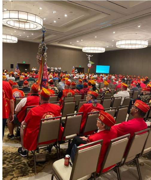
Audience at Marine Corps League Convention