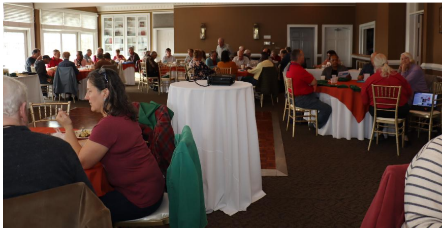
Audience at the Nov. 17 Meeting of Chapter 969 St. Mary's County