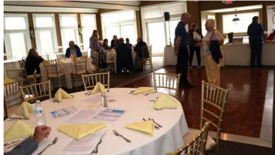
Starting to gather