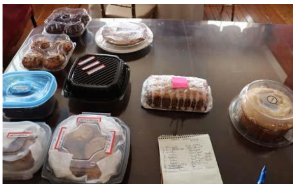
The Cake Raffle