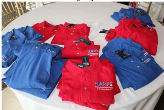
Shirts are still available