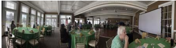
Look at all the green!