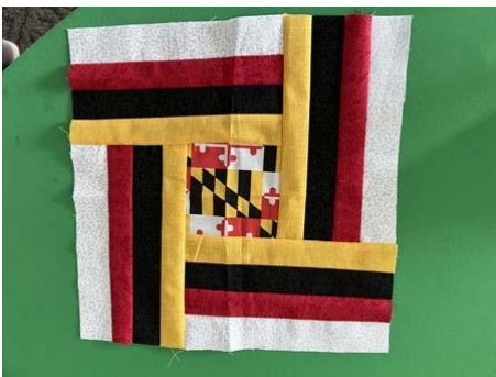
Sherry Quade's block pattern for this year's Alzheimer's quilt

Many delicious goodies in the raffle this month!