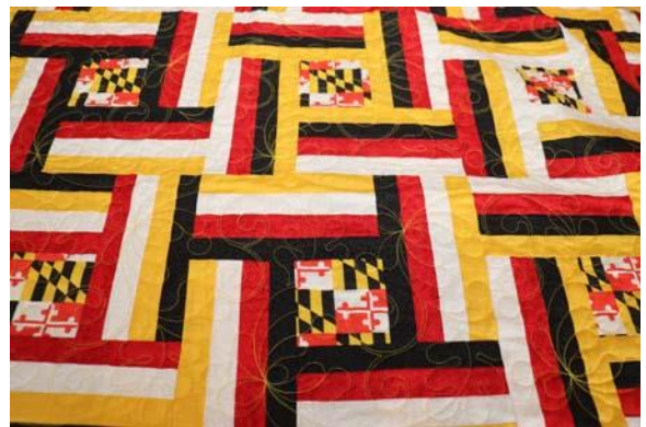
Look at that stitching!